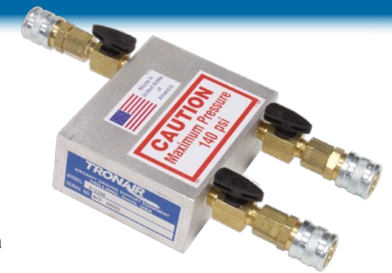
K-1106 Air Pump Manifold Kit