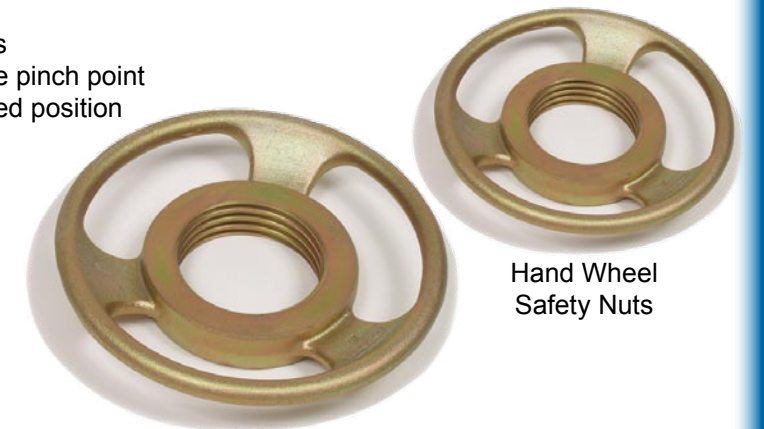
Hand Wheel Safety Nuts

visit tronair.com for detailed information